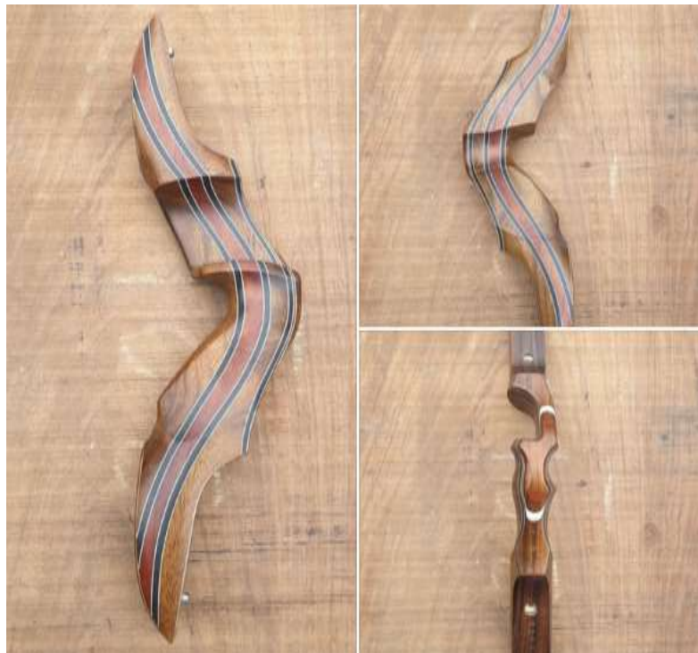
SN1647 17" RH. Shedua with Bubunga Centre. White Accents