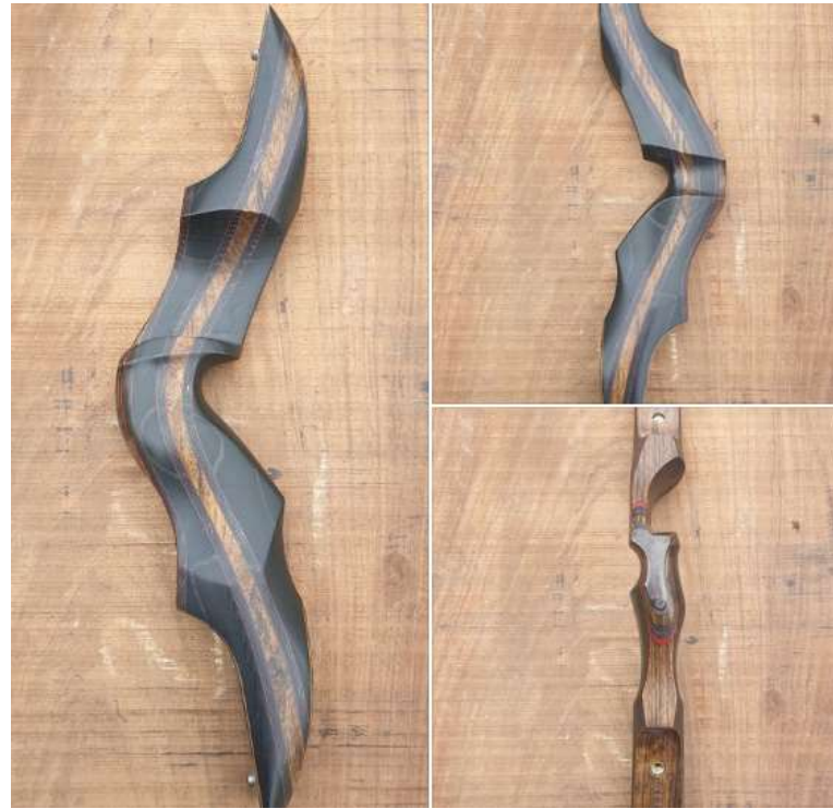
SN5145 19" RH. Phenolic with Shedua Centre. Red Accents