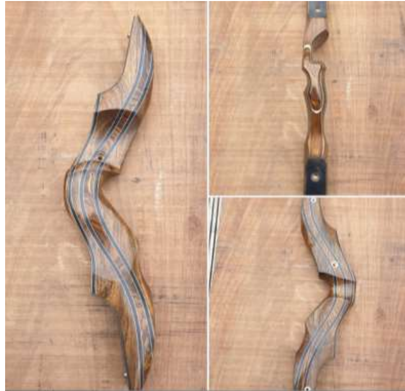
SN7099 19" RH. Shedua Outer with Becote Centre. White Accents. Quiver Inserts and Plunger Bush with Countersink for Strike Plate.