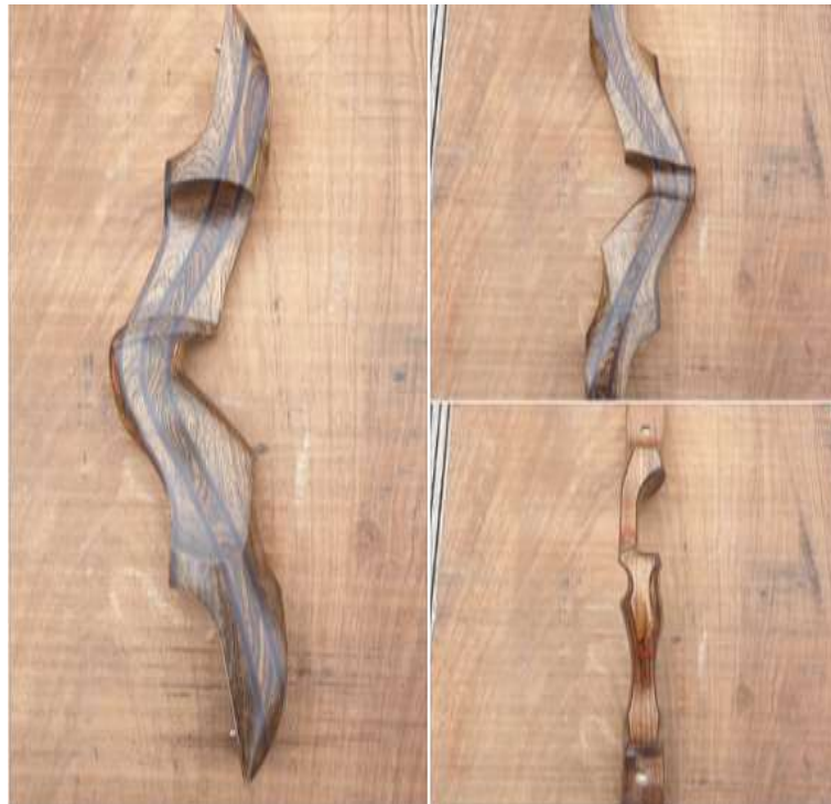
SN7039 21" RH. Shedua with Becote Centre and Red Accents.