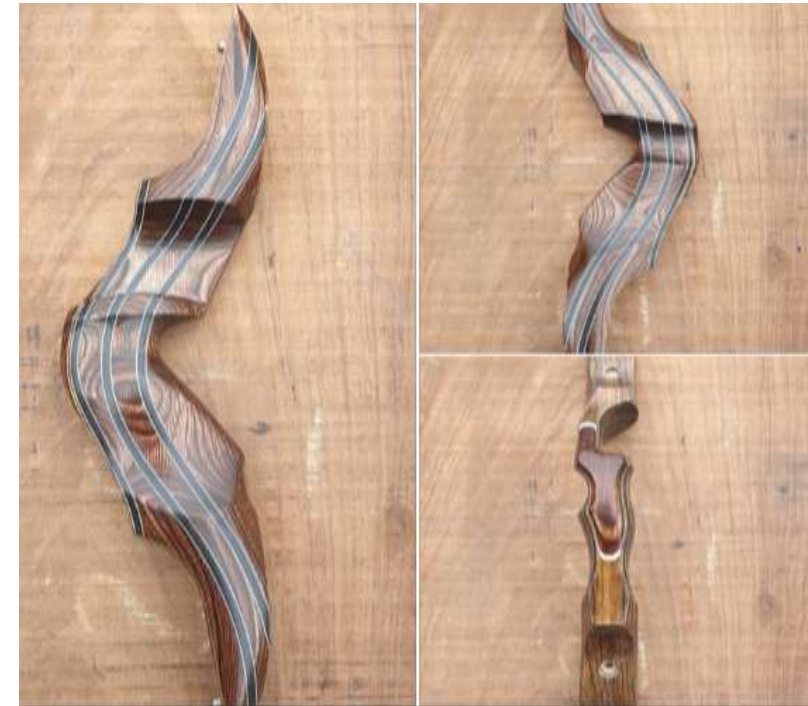
SN7046 17" RH. All Heritage Walnut with White Accents.