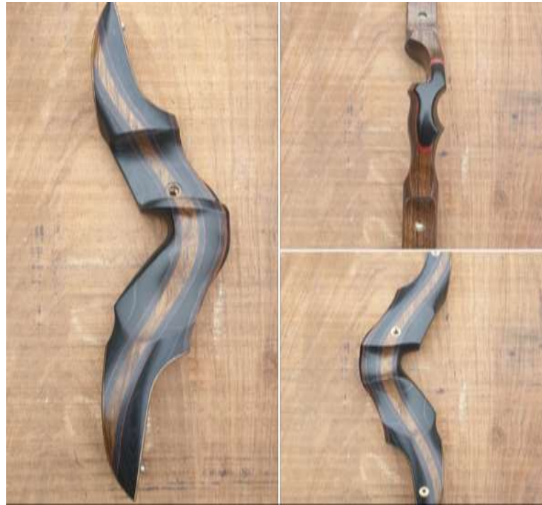
SN4545 17" LH. Phenolic with Shedua Centre. Plunger Bush with Strike Plate Recess. Quiver Inserts and Buffalo Horn Overlay