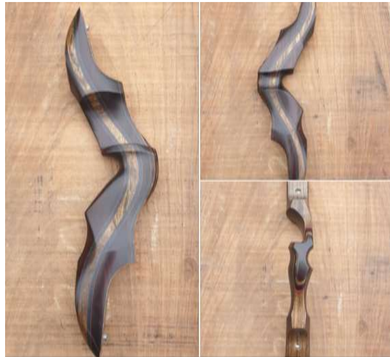
SN5571 19" LH. Indonesian Rosewood with Shedua Centre. Red Accents.