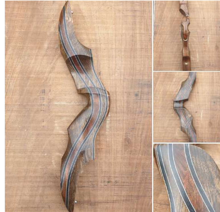
SN7038 19" LH. Shedua with Honduras Walnut Centre. White Accents.