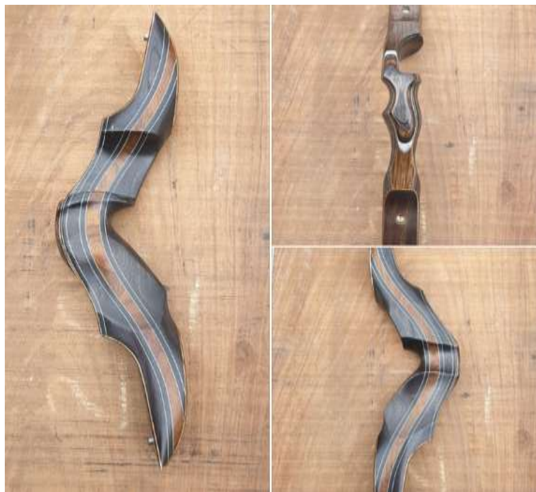
SN3365 17" RH. Heritage Midnight with Shedua Centre. White Accents