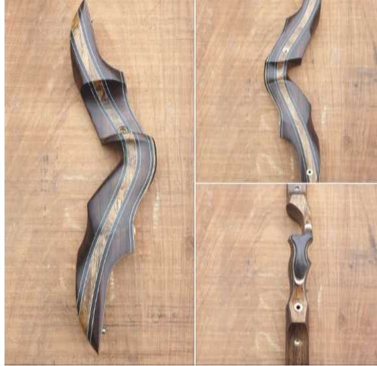
SN7086 19" LH. Indonesian Rosewood with Shedua Centre. White Accents. Light Mass Stabiliser Bush with Strike Plate Countersink. Quiver Inserts and a Horn Overlay.