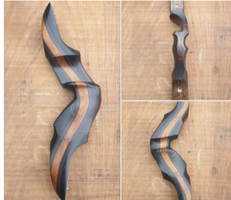
SN5612 17" LH. Phenolic with Shedua Centre. Carbon Overlays. Grip for a Larger Hand.