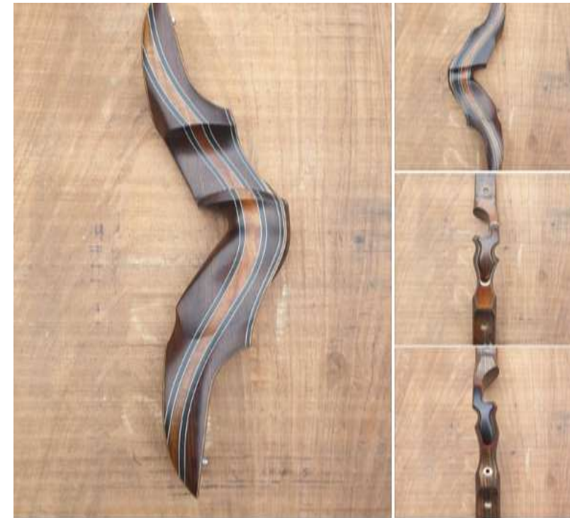
SN1270 17" LH. Wenge Outers with Shedua Centre. White Accents