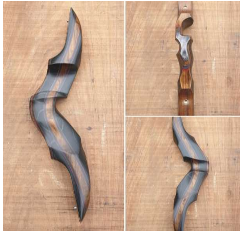
SN6097 17" RH. Phenolic with Shedua Centre. Red Accents. Riser Cut for a Larger Hand