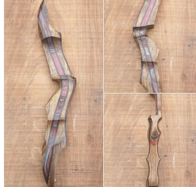
SN5677 23" LH. Shedua Outers and Heritage Jacaranda Centre. Red Accents.