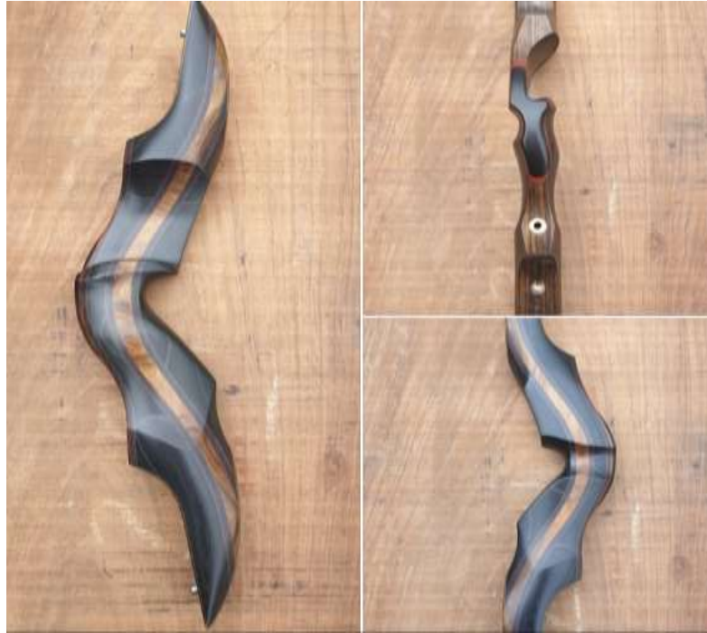
SN4953 19" RH. Phenolic with Shedua Centre. Red Accents. Buffalo Horn Overlay and Light Mass Stabiliser Bush.