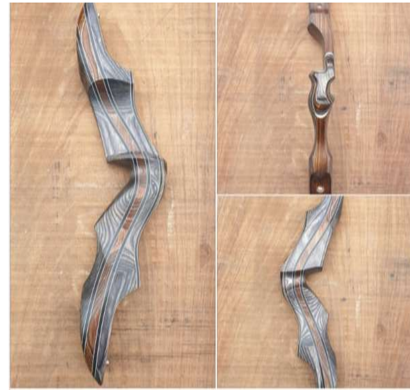
SN1276 21" LH. Heritage Midnight with Heritage Walnut Centre. White Accents