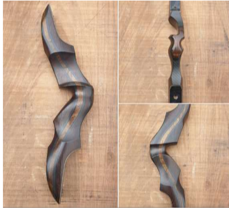
SN1172 19" LH. Wenge with Shedua Centre. Carbon Overlay and Black Accents.