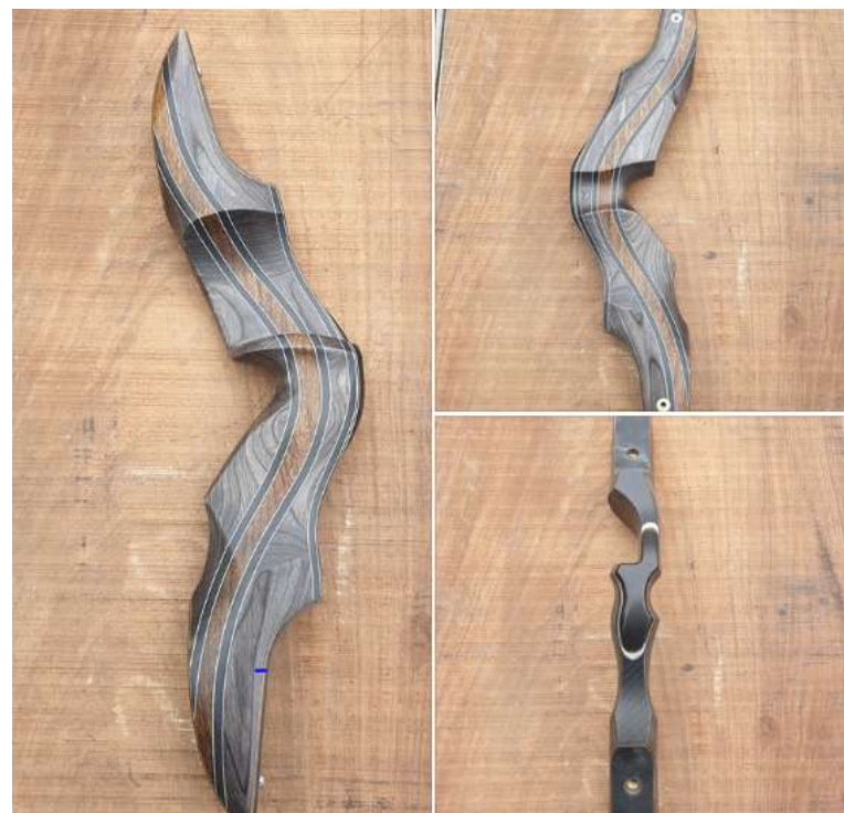
SN4666 19" LH. Heritage Midnight with Shedua Centre. White Accents. Carbon & Buffalo Horn Overlay and Quiver Inserts.