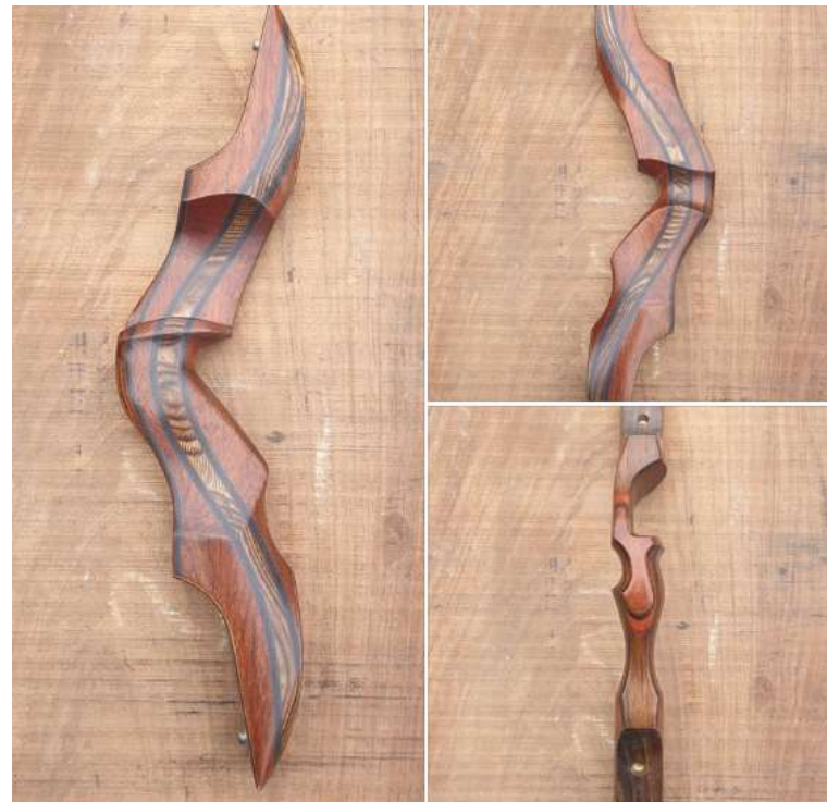
SN5986 19" RH. Burmese Paduk with Heritage Walnut Centre. Red Accents.