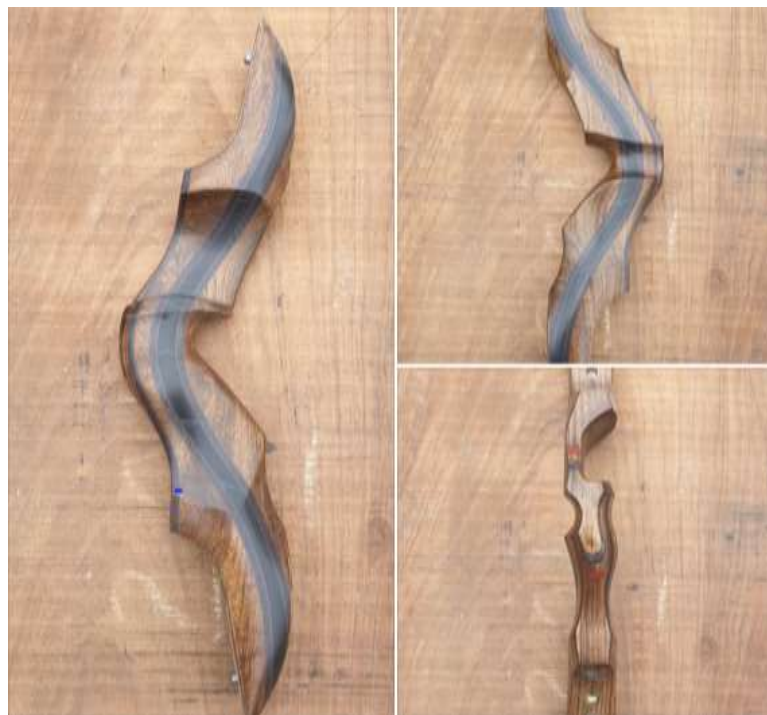
SN5631 19" RH. Shedua with Phenolic Centre. Red Accents