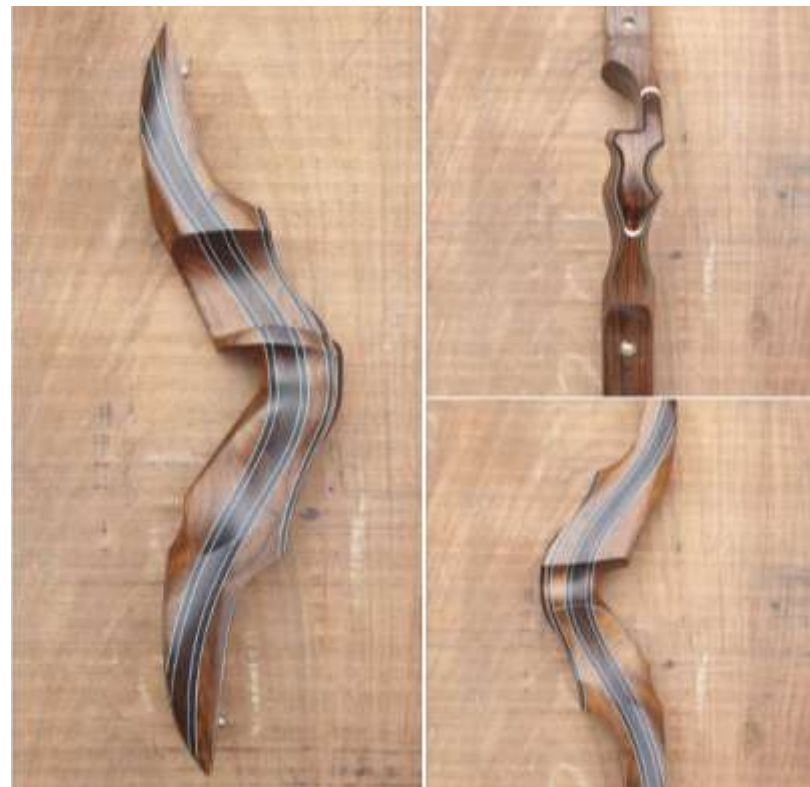
SN1272 17" RH. Shedua Outers with Indonesian Rosewood Centre, White Accents