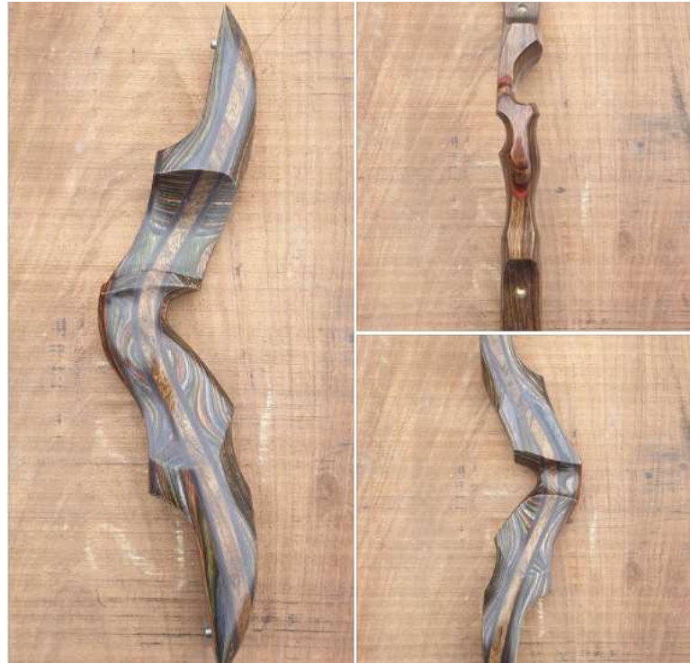
SN5834 19" RH. Heritage Forrest Camo with Shedua Centre. Red Accents.