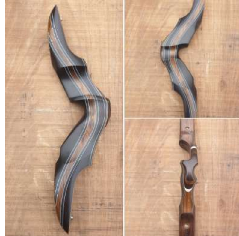
SN1720 17" LH. Indonesian Rosewood with Shedua Centre, White Accents