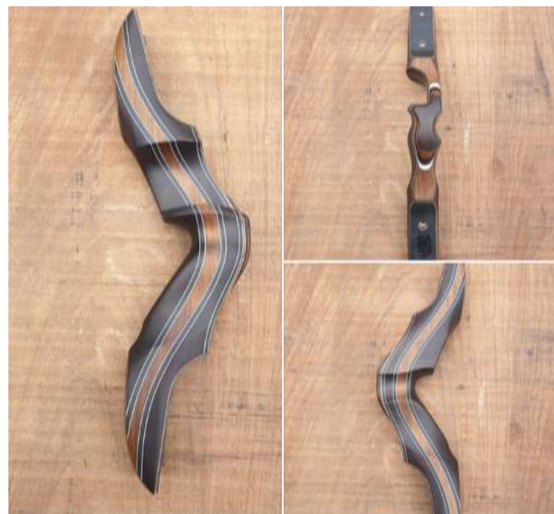
SN1575 17" LH. Indonesian Rosewood with Shedua Centre. White Accents