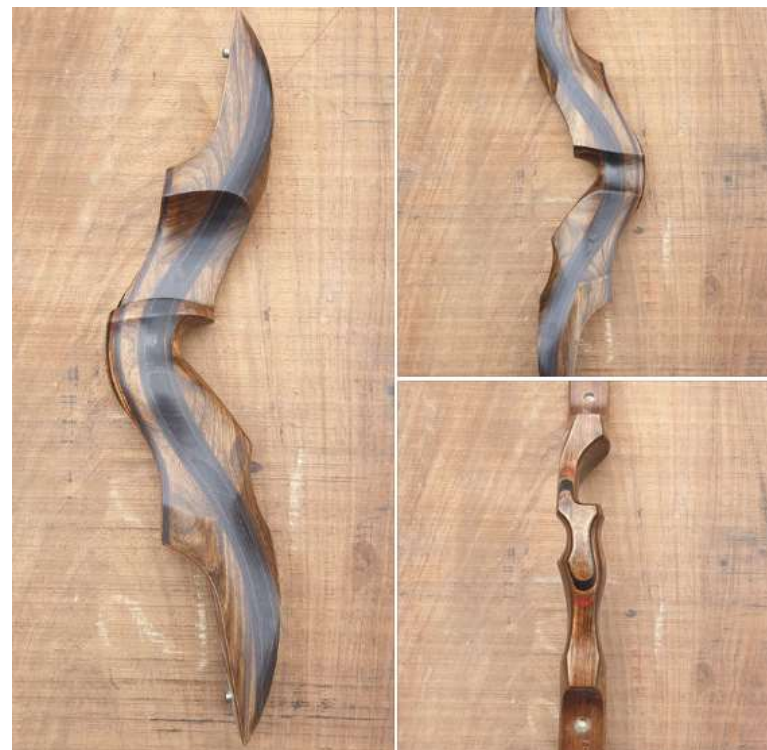
SN7041 19" RH. Shedua with Heritage Midnight Centre. Red Accents.