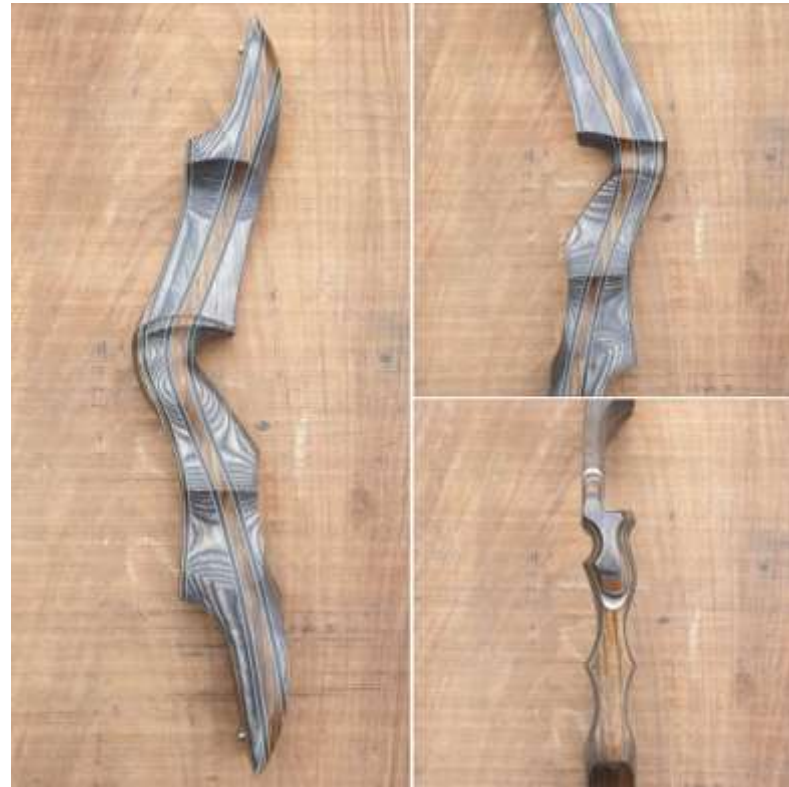
SN1060 23" RH Heritage Midnight with Shedua Centre, White Accents