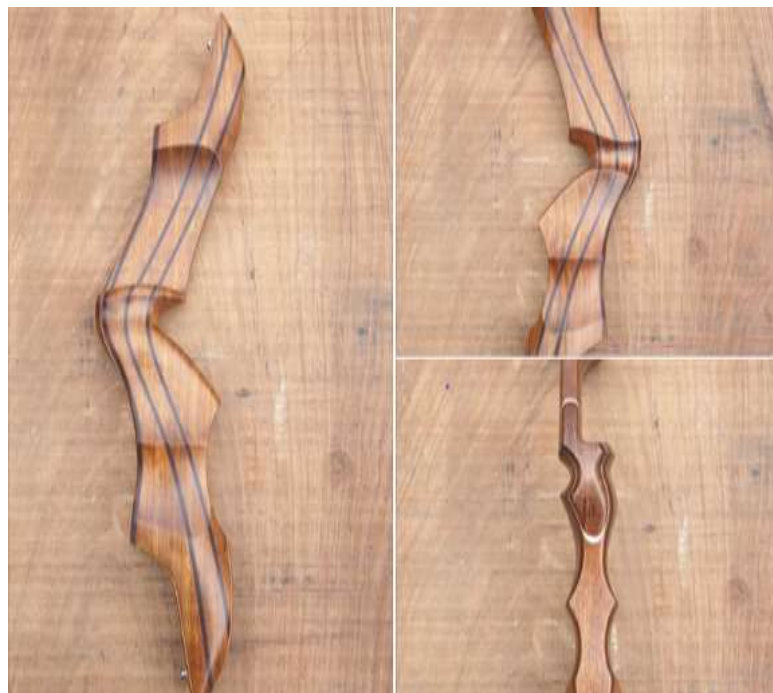
SN3864 23" RH. All Shedua with Red Accents