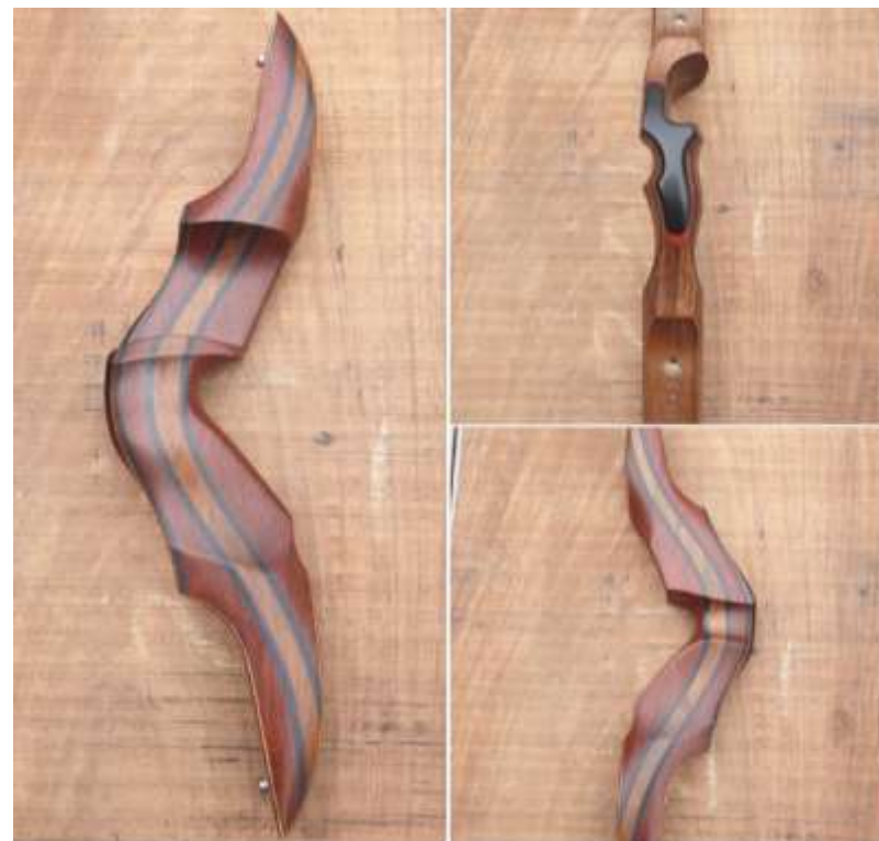
SN3410 17" RH. Mystery Wood with Shedua Centre. Red Accents and Buffalo Horn Overlay