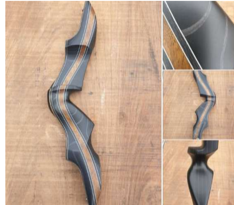
SN7845 21" RH. Paper Based Phenolic (Usually Cotton Based) with Shedua Centre. White Accents. Full Palm Swell and Quiver Inserts.