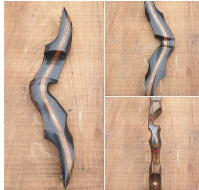
SN5717 19" RH. Phenolic with Shedua Centre. Red Accents